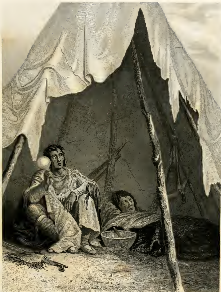
A MEDICINE MAN ADMINISTERING TREATMENT.